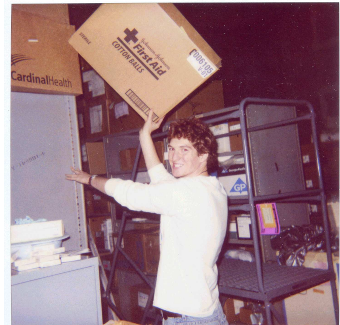
St Paul student exhibits superhuman strength.

God can't be outdone in generosity, for after each Saturday work session, all volunteers receive free pizza and soft drinks....a small reward for great commitment and hard work.