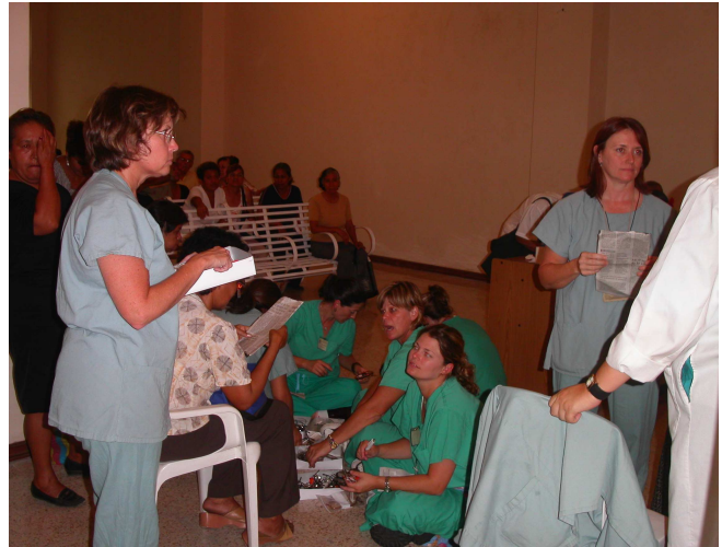
Some of the 1,100 patients receiving eyeglasses during the 2004

The dedication of the medical staff was an inspiration. The work they did not only healed, cured, saved life, but also educated and updated local physicians. The eye clinic was such a wonderful place to be: there I had the opportunity to relate directly with those in need. To experience the joy of those who could see again and could now work, read and navigate daily life was truly a life-changing experience. As they reached out to us, so we reached out to God's children in need and we all grew in love.